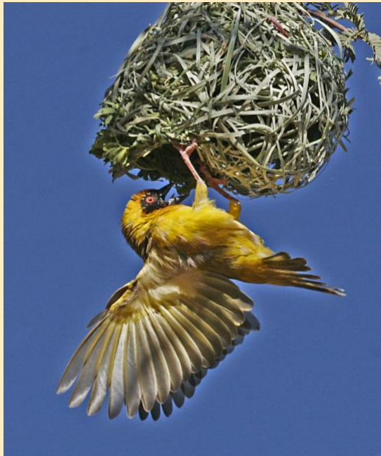
Masked Weaver, Namibia