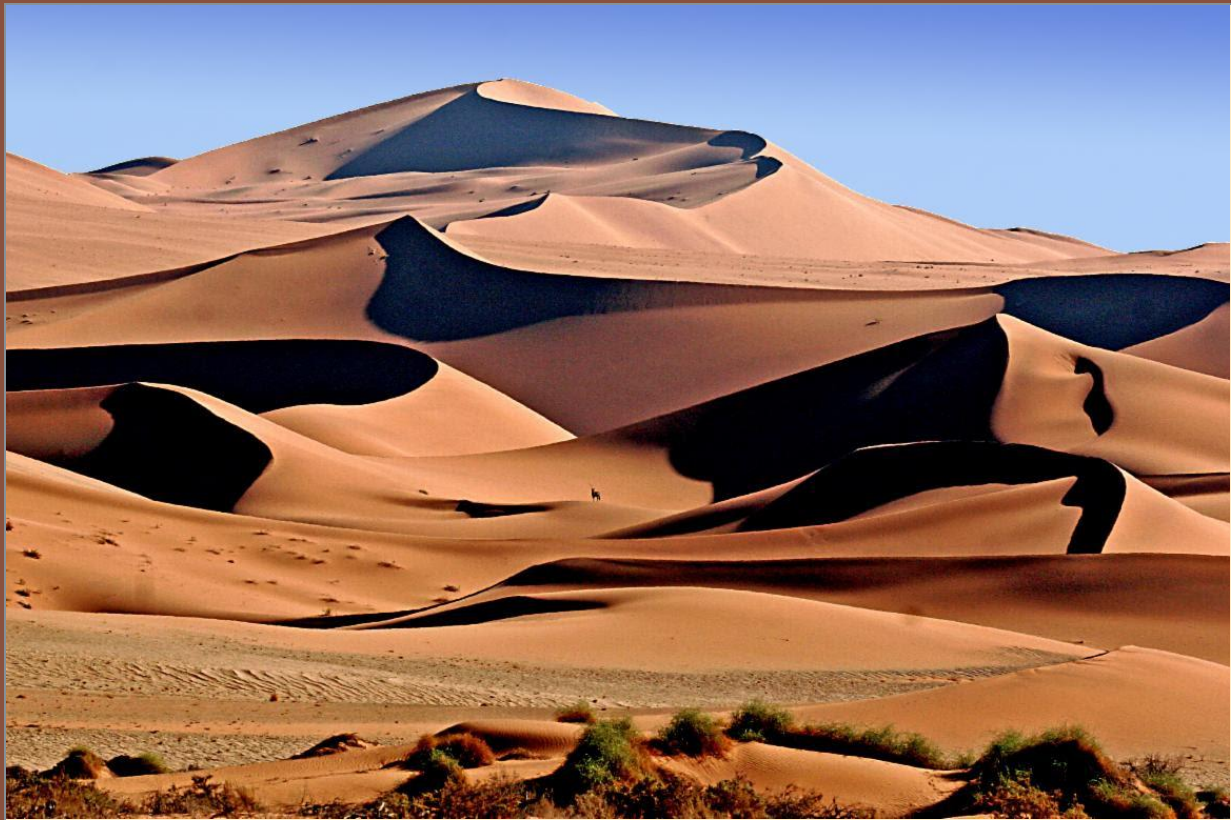
Namibian Sand Dunes