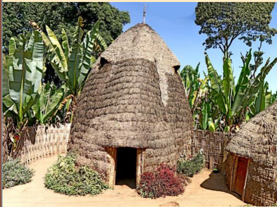
Dorze Village Beehive House, Ethiopia